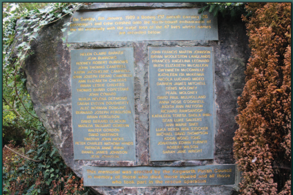
Memorial situated in the cemetery on Whatton Road